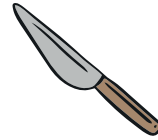
Sharp knife (ask a grown up for help!)