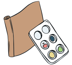
Paint and paper