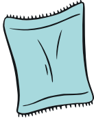
Kitchen paper or tea towel